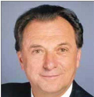
Charles Kelman, MD